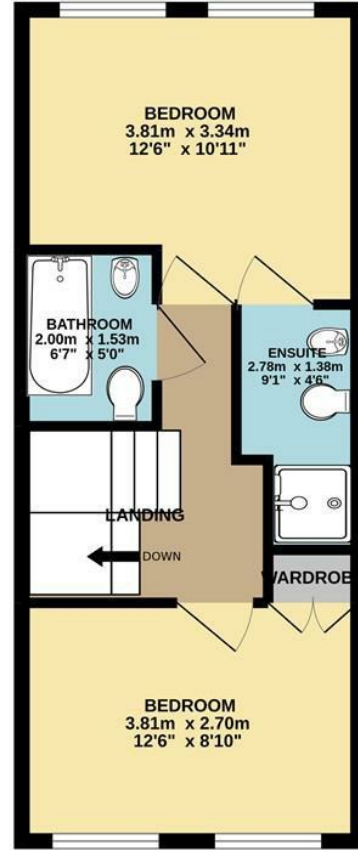
2ND FLOOR 35.9 sq.m. (386 sq.ft.) approx.